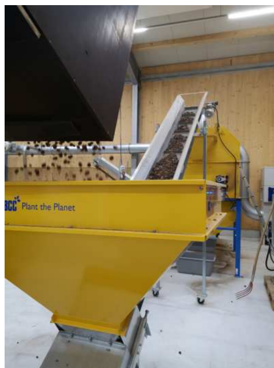
Seed crusher (mill)

not properly separated from the foreign bodies. from the foreign bodies.