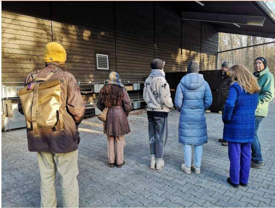
Excursion group in front of the hall

EXCURSION SAMENDARRE HESSENFORST IN HANAU