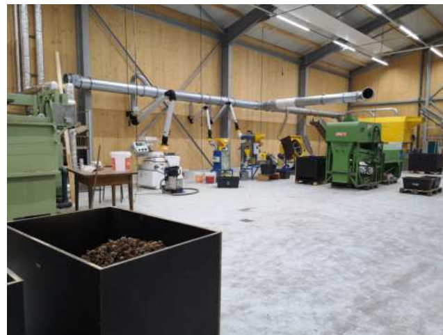
Interior view of the new hall

The new hall contains some very modern, also newly purchased, machines for processing and separation of forest seed. Some machines are even custom-built, such as a self-developed Washing system Interior view of the new hall for acorns. The new hall is also equipped with a large drying chamber and a modern pellet heating system, including a pellet store.